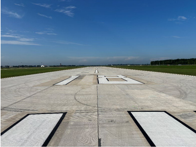
Pictured above is a ground-level view of the completed AEX Runway 18/36.

England Economic & Industrial Development District 1611 Arnold Drive, Alexandria, LA 71303 OFFICE: 318-449-3504 FAX: 318-449-3506 www.Englandairpark.org | www.flyaex.org